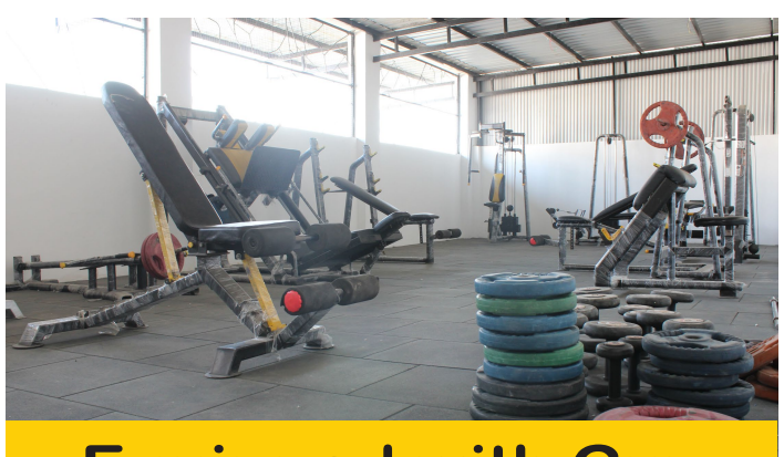
Equipped with Gym